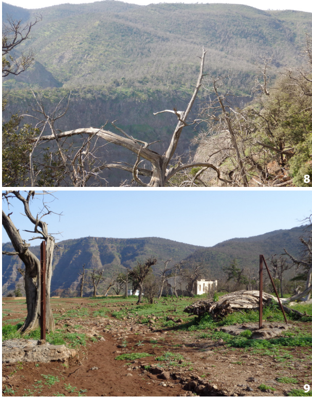
Figures 8, 9. General habitat types of survey Location 2 (Day Forest). 8. Declining juniper forest, deep canyons, low growing understory. 9. Remnants of a building that was previously the governor's house (background) with heavily grazed areas.

the Goda Mountains (Welch and Welch 1984), our short visit focused on a small area (Fig. 8) around the remnants of a building (11.77°N, 042.68°E) that was previously the governor's house (Fig. 9). Rugged nearby areas at higher elevation that were accessible by foot appeared to have denser understory vegetation than lower areas, likely due to difficulty in reaching higher areas for cattle and camel grazing. The Day Forest ranges in altitude from 182–1,783 m (Magin 2001) but we were not able to access the lower more vegetated wadis or spend much time in the highest elevation areas at our location.