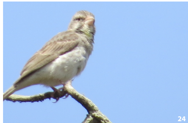
Figures 23, 24. Birds of Djibouti. 23. Estrilda rhodopyga . 24. Crithagra sp.

Region. It is listed as common to locally abundant in Djibouti (Redman et al. 2011).