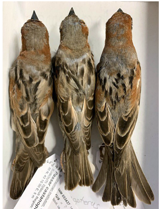
Figure 22. Three specimens (USNM 653437, 653438, 653398) collected at Camp Lemonnier, Djibouti showing potential hybridization between Passer c. castanopterus and Passer domesticus indicus .

Collected material. DJIBOUTI • 1 male; Djibouti Region, Camp Lemonnier, ca 5.5 km SE Djibouti; 11.5417°N, 043.1667°E; 5 m elevation; 6 May 2014; NMNH exped.; widely interspersed Acacia/Prosopis forest; Genbank: KU722434; XenoCanto: XC406785; USNM 647797.