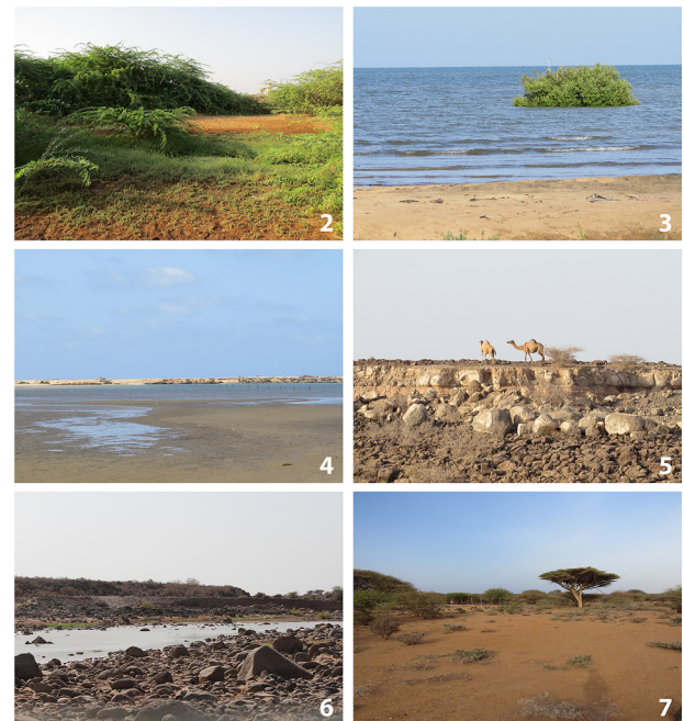
Figures 2–7. General habitat types of study Location 1 near Camp Lemonnier, Djibouti. 2. Acacia scrub within and adjacent to Camp Lemonnier. 3. Shoreline with sparse mangroves. 4. Low tide mud flat looking toward Haramous Island. 5. Rocky plateaus and sandy fields near Ambouli River. 6. Seasonal Ambouli River near village of Chabelley. 7. Décan Refuge restored habitat.

Location 2: Day Forest (Figs 8, 9). Surveys were confined to an area accessible by truck or foot from Campement Touristique de la Forêt du Day, a local overnight facility. Although the Day Forest covers a vast area within