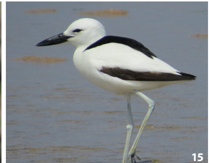
Figures 10–15. Birds of Djibouti. 10. Alopochen aegyptiaca . 11. Pternistis ochropectus . 12. Mycteria ibis . 13. Pelecanus rufescens . 14. Neophron percnopterus . 15. Dromas ardeola .