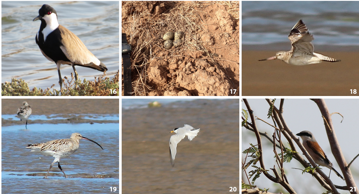
Figures 16–21. Birds of Djibouti. 16. Vanellus spinosus . 17. Vanellus spinosus , nest. 18. Limosa lapponica . 19. Numenius arquata . 20. Sternula albifrons . 21. Lanius collurio .

individual was observed riding thermals west of the Ambouli River on 11 February 2016 within Location 1. Immatures and adults were commonly observed at the Day Forest 16–19 February 2016 and we therefore agree with Welch and Welch (1984) that this species is abundant in Djibouti, especially near human habitation. Redman et al. (2011) list Egyptian Vulture Neophron percnopterus as a resident breeder as well as a non-breeding visitor for Djibouti. McGrady et al. (2014) list this species as one of the most common raptor migrants across the Bab el Mandeb Strait, Djibouti.