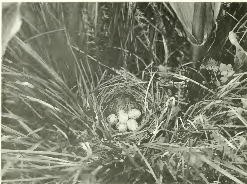
San Bernardino Mountains, Calif.