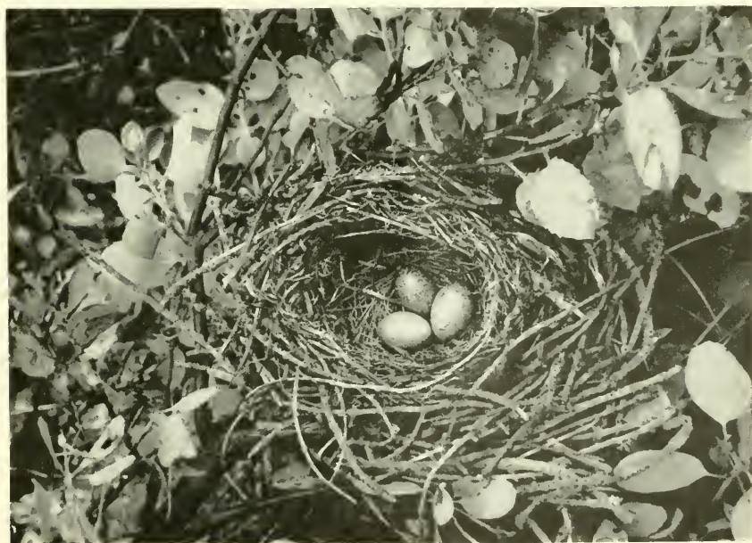
Tulare County, Calif., May 27, 1939