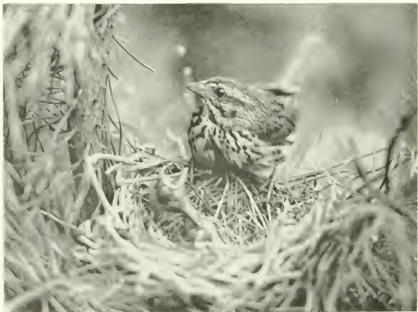
Lake Summit, N.C., July 1950