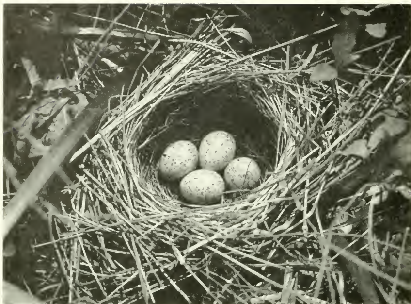
Madison County, Ill., May 24, 1936