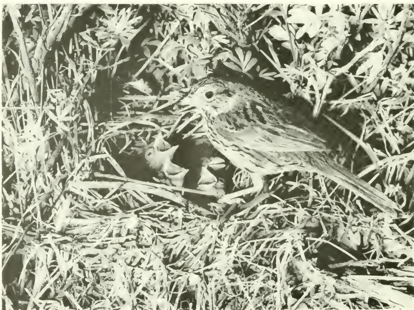
Uinta Mountains, Utah