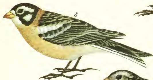
C. p. pictus