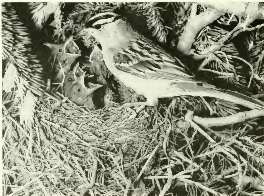
Uinta Mountains, Utah