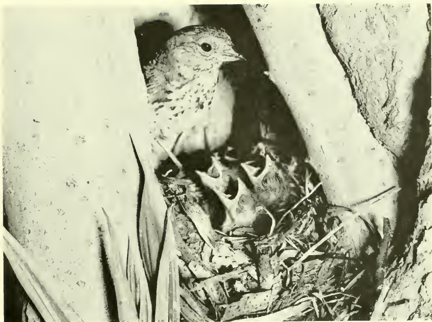
Uinta Mountains, Utah