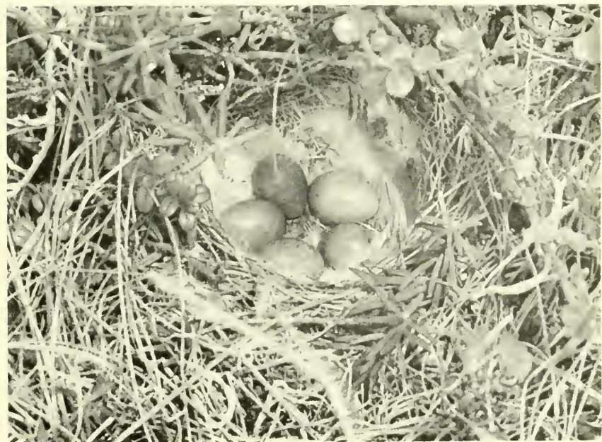
Johnson River, Alaska, June 8, 1946