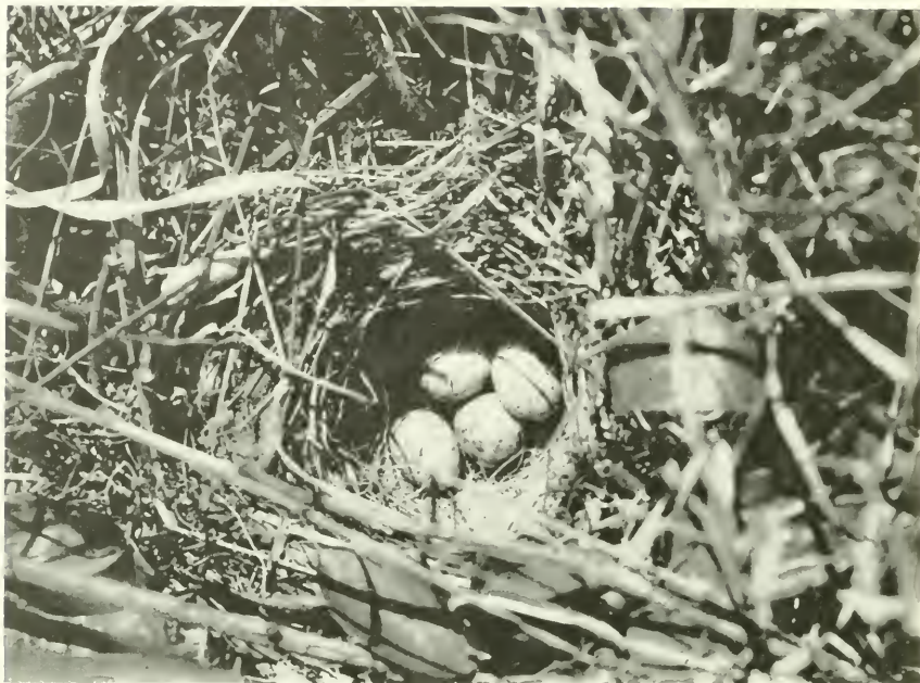
Sault Sainte Marie, Mich., May 30, 1925