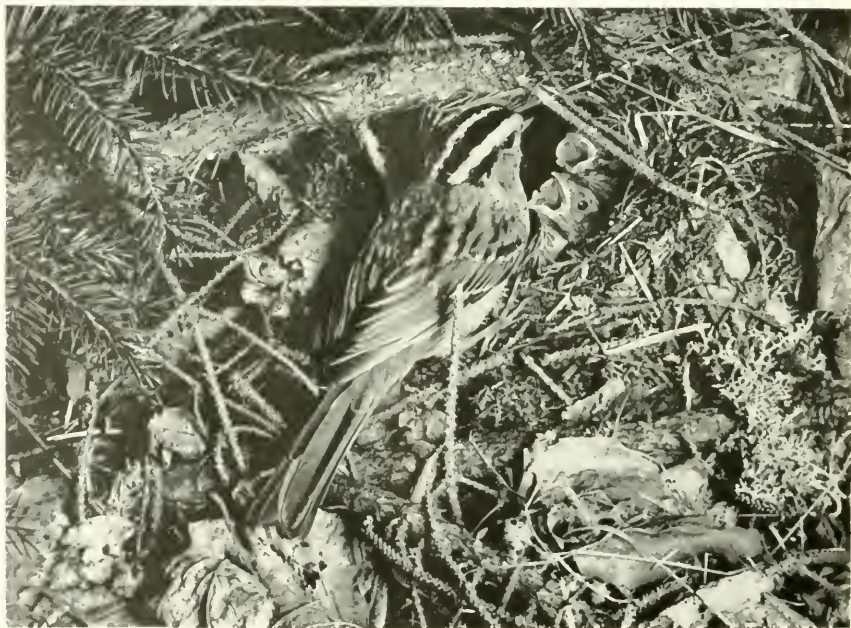
Maine, June 28, 1939