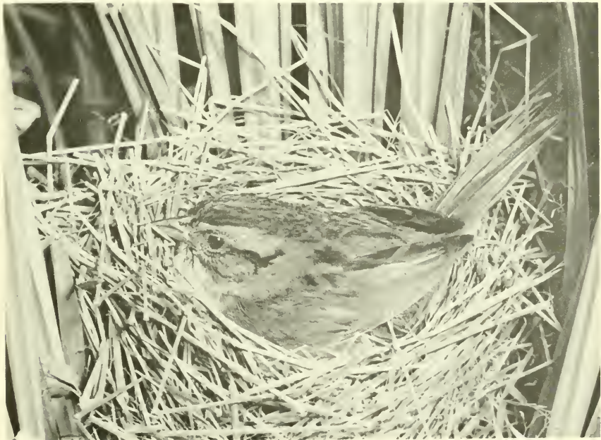
Crawford County, Pa., June 1949