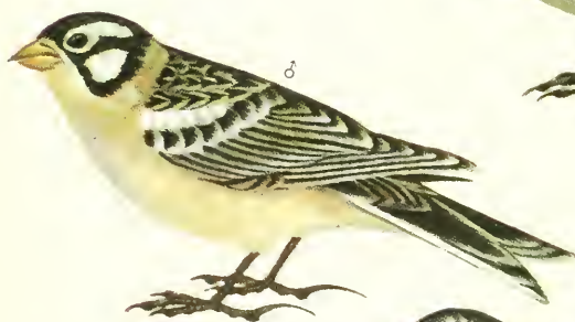
C. p. mersi