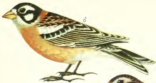
C. p. roweorum