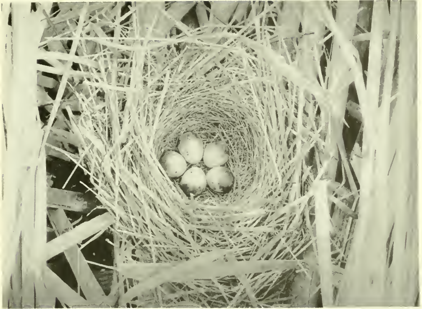
Eric County, N.Y., June 1928