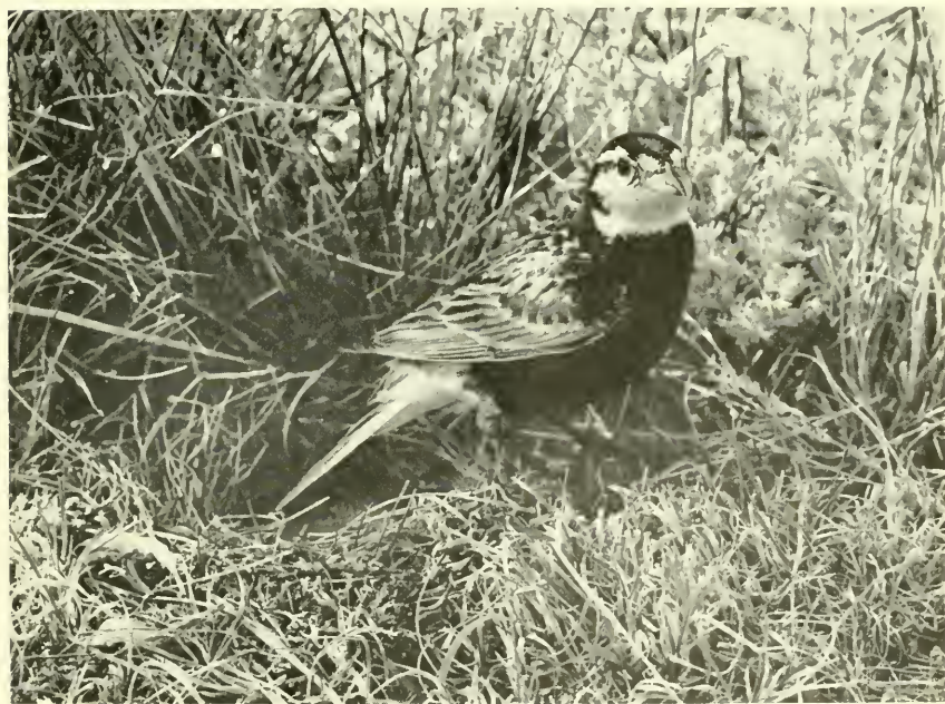
Lake Bowdoin National Wildlife Refuge, Malta, Mont.