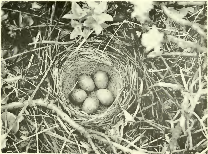
Churchill, Manitoba, June 25, 1947