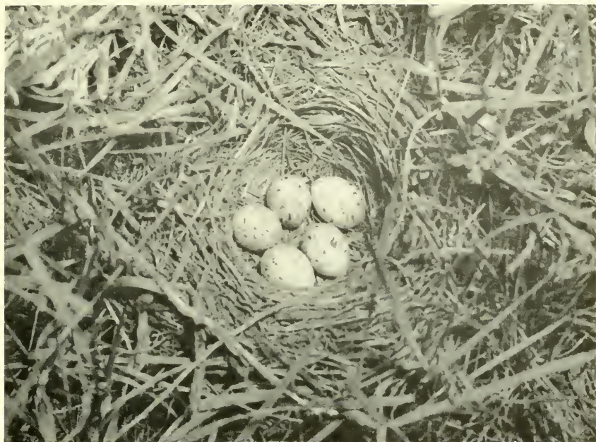
Woodrow, Saskatchewan, June 1947