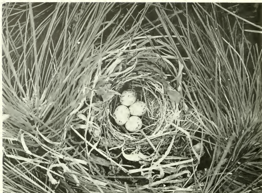
Berkeley, Calif., May 3, 1946